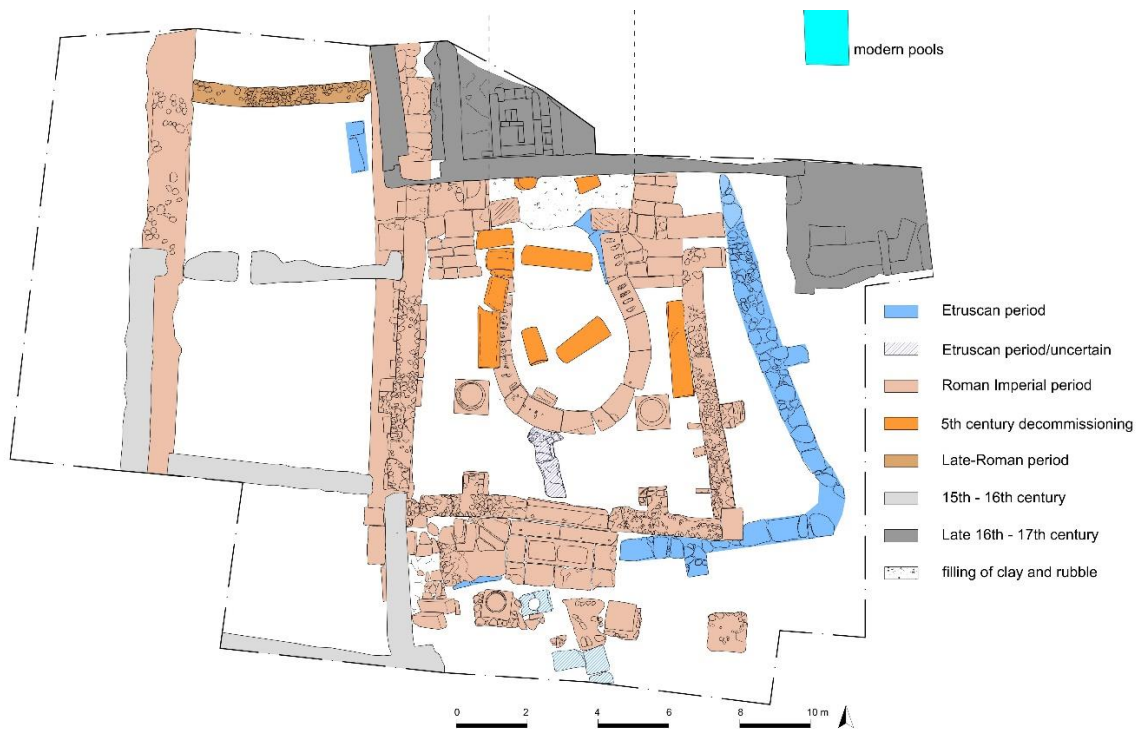
Fig. 2: Bagno Grande: plan of the structures and periodisation (elaboration by Emanuele Mariotti, © SABAP-SI and Municipality of San Casciano dei Bagni).