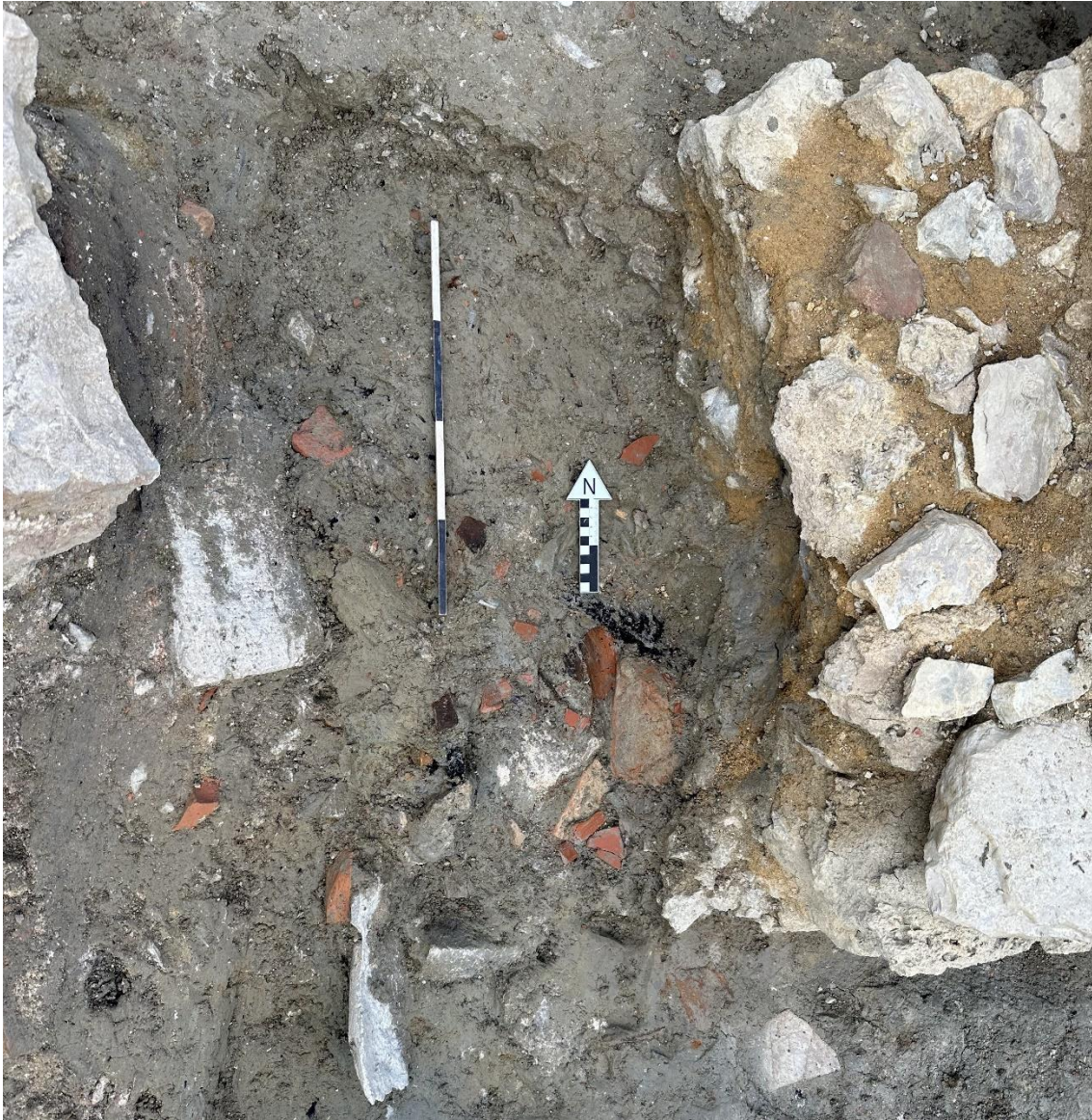
Fig. 15: Bagno Grande: US 4134, excavation detail.

Roman Imperial period 48 , testifying to what must have been a static necessity: the clay nature of the ground and the continuous inflow and movement due to water table must have been one of the major problems for the stability of the structures 49 . Near the south-eastern corner, the east wall bends sharply to the east (Figs. 10-11), distorting the general perception of what must have been the south front of the pre-Imperial building. This bend is due to two different factors: the aforementioned instability of the clay soil, which bends and changes the course of the structures 50 , even later; and the presence of a trace of stone removal 51 at the corner itself. The corner of the pre-