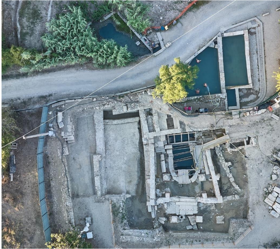
Fig. 1: Bagno Grande: aerial view of the excavation area.