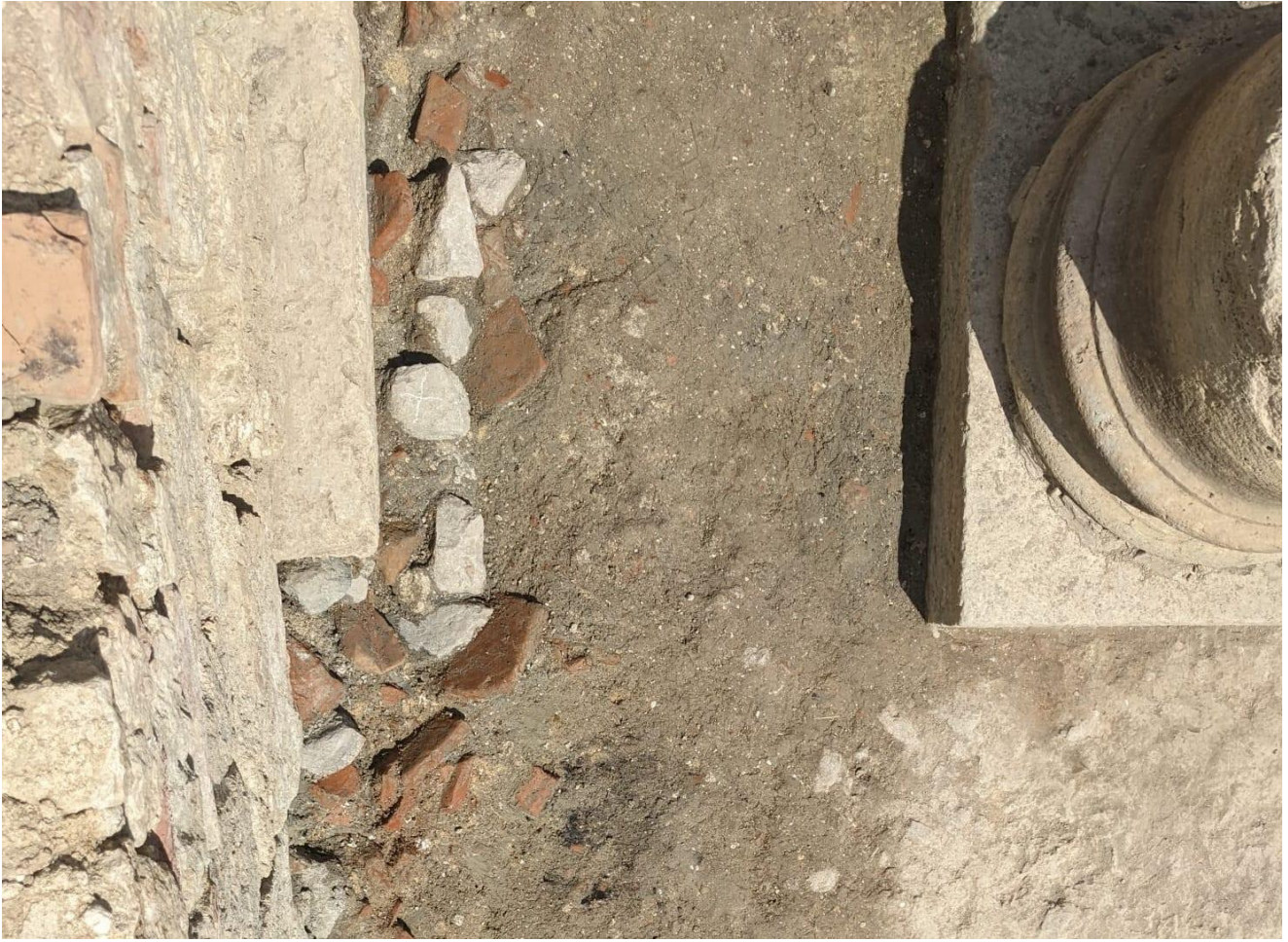
Fig. 8: Bagno Grande: detail of the donarium out of joint on the inner western face of the temple