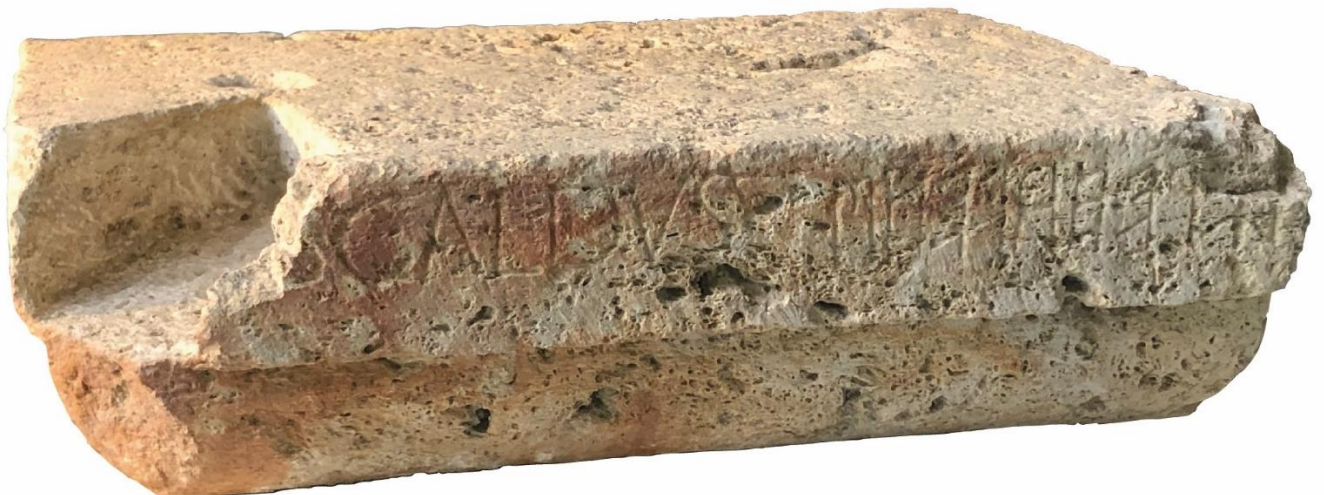
Fig. 9: Bagno Grande: travertine base of altar with bilingual inscription