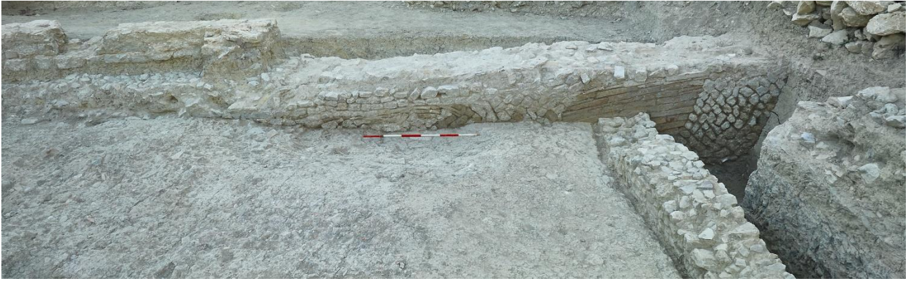
Fig. 3: Bagno Grande: western wall