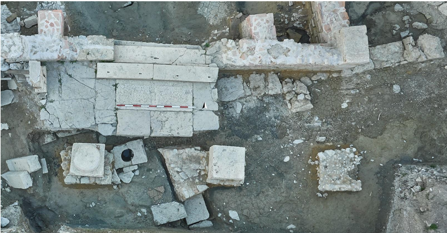
Fig. 14: Bagno Grande: aerial view of the southern part of the excavation area; note the presence of the above-mentioned well close to the later Roman pavements.