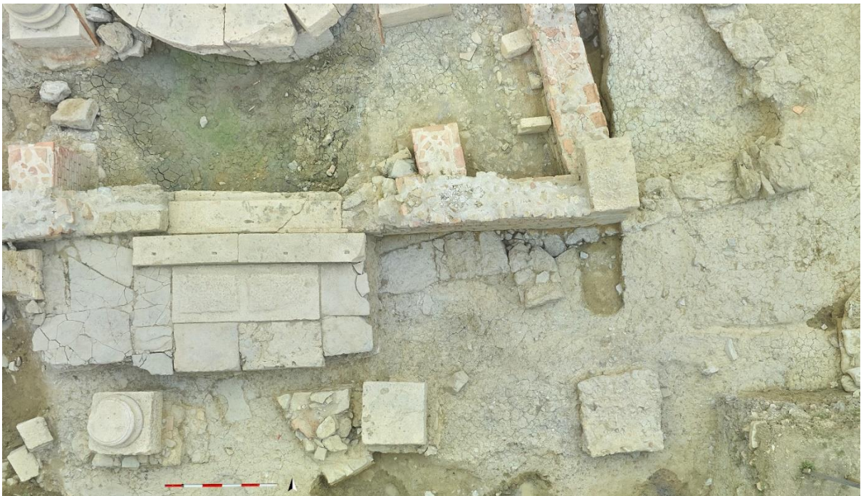
Fig. 11: Bagno Grande: south-eastern corner of the excavation area.