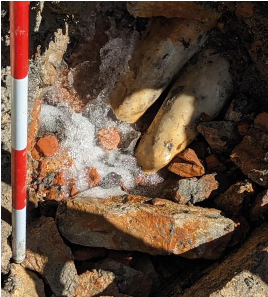
Fig. 4: Bagno Grande: the legs of Apollo Sauroctonos