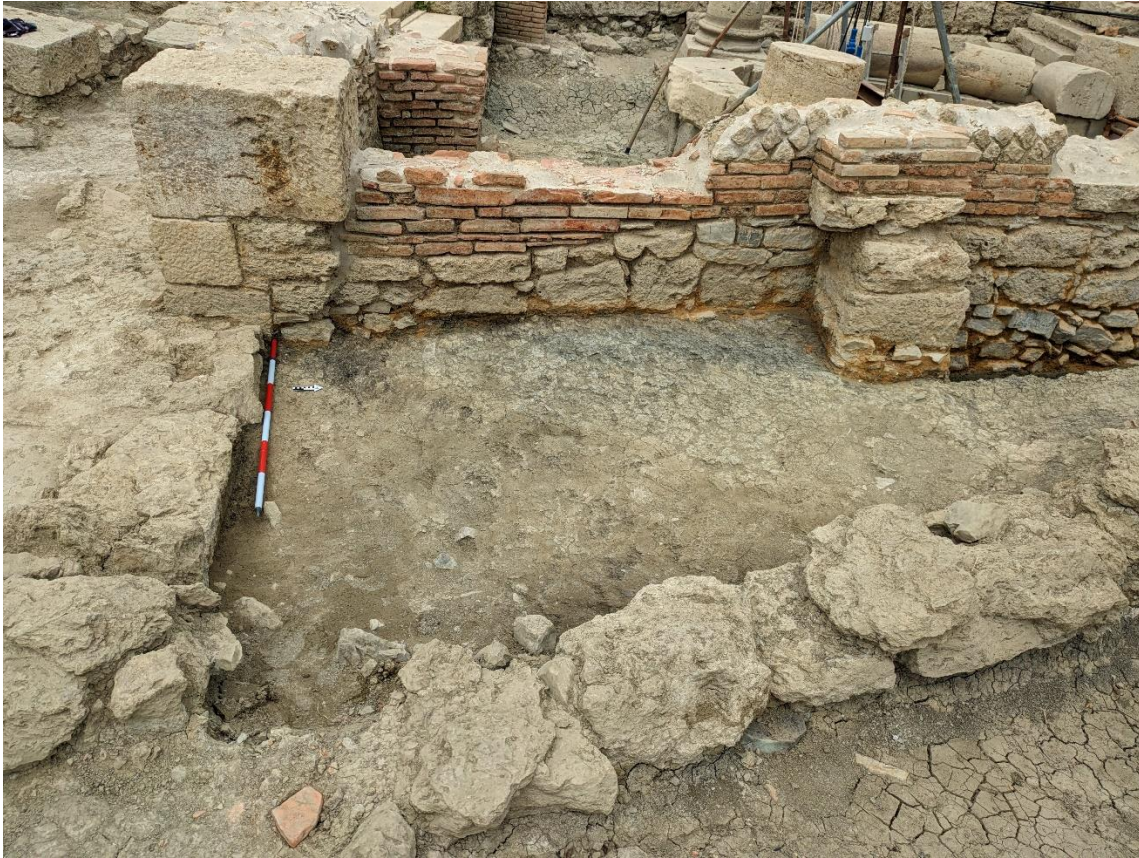
Fig. 12: Bagno Grande: southeastern corner of the structures, view from the east.