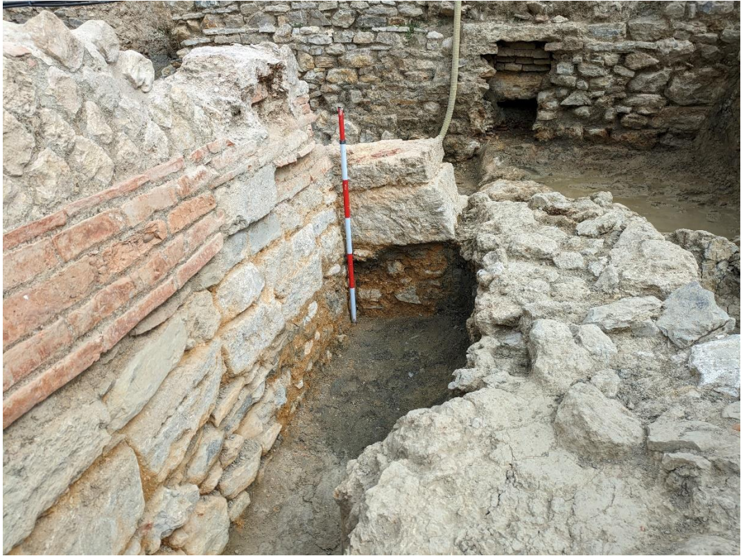
Fig. 13: Bagno Grande: eastern wall and its foundation pit of the Roman-era building (photo by Emanuele Mariotti, © SABAP-SI and Municipality of San Casciano dei Bagni).