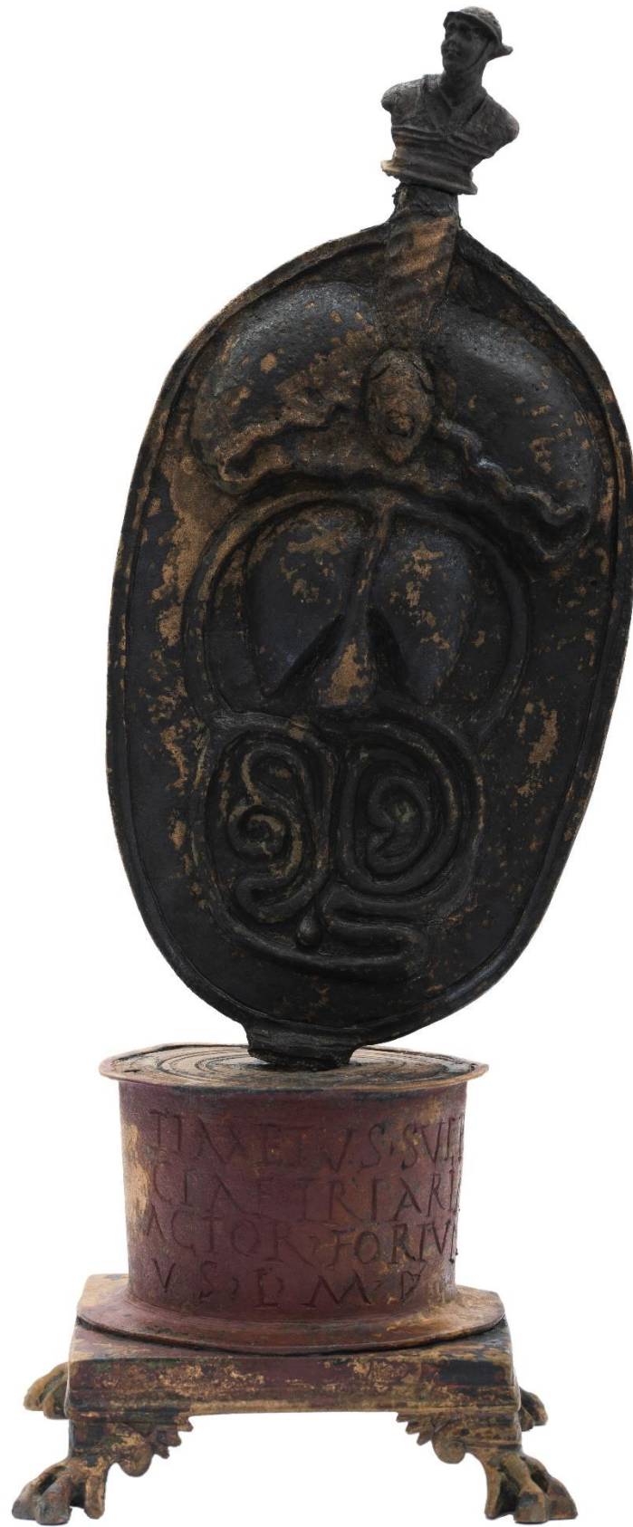
Fig. 5: Bagno Grande: polyvisceral plate