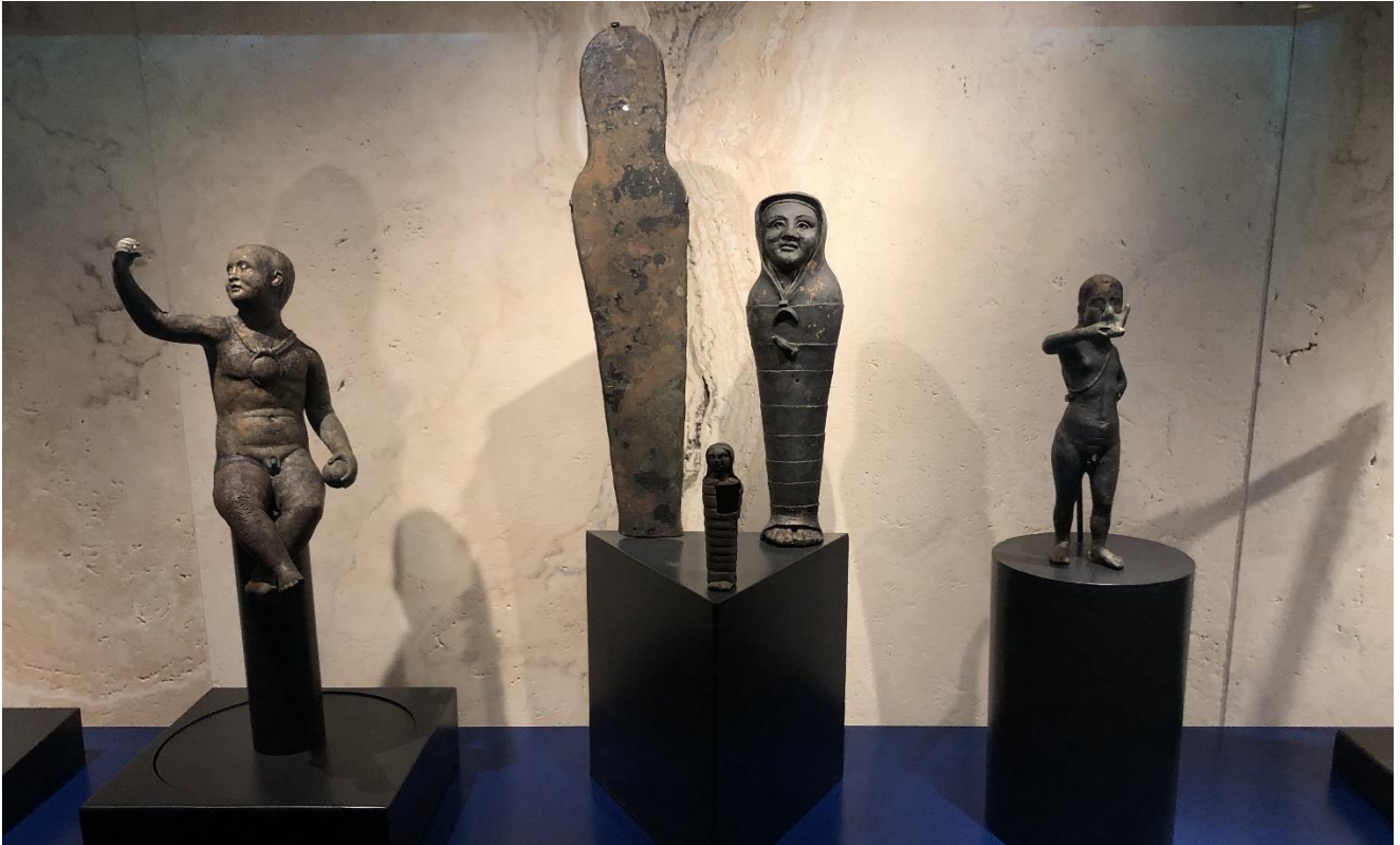
Fig. 6: Bagno Grande: the putto from San Casciano dei Bagni in the exhibition at Palazzo del Quirinale